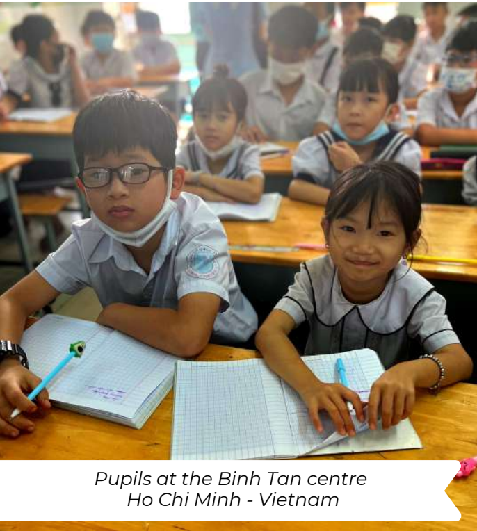
Pupils at the Binh Tan centre Ho Chi Minh - Vietnam

After not being able to visit Vietnam for several years because of the pandemic, a sponsorship mission took place at the beginning of 2023. Vietnam has suffered from the closure of its borders and the lack of tourism, one of its main economic resources. As in many countries, prices are rising steadily. The poorest families move house several times a year as their rents continue to rise. In the most outlying districts, the families of sponsored children pay up to 50 euros a month for around twenty square metres. The minimum wage is currently 3,430,000 dong (130 euros), but some people live on much less. The parents of the children we support are lottery ticket sellers, shoeshine boys or street vendors. They earn just a few euros a day. Most of the children go to school in the morning, and not all of them have access to lunch. There are no school fees, but in reality everyone pays management fees for cleaning staff, repairs and so on, and these fees vary between 20 and 40 euros a month. For students, university fees are extremely high: between €600 and €2,000.