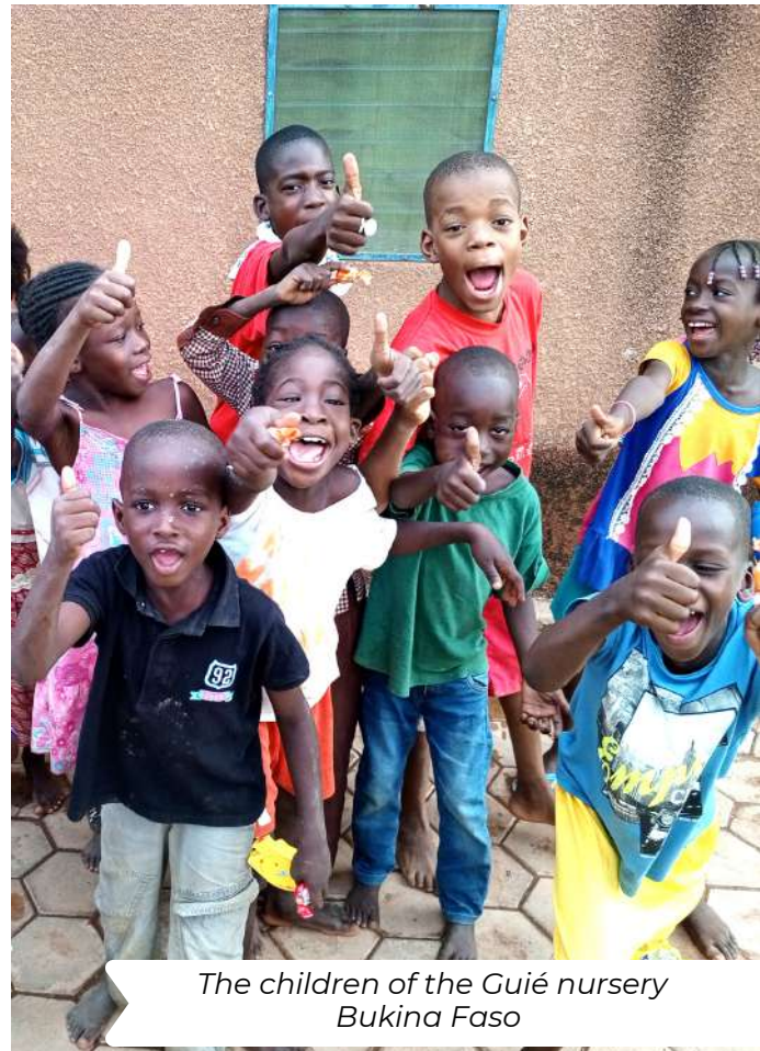
The children of the Guié nursery Burkina Faso

For all these young people, studying today is a hope of contributing to the prosperity of their country.