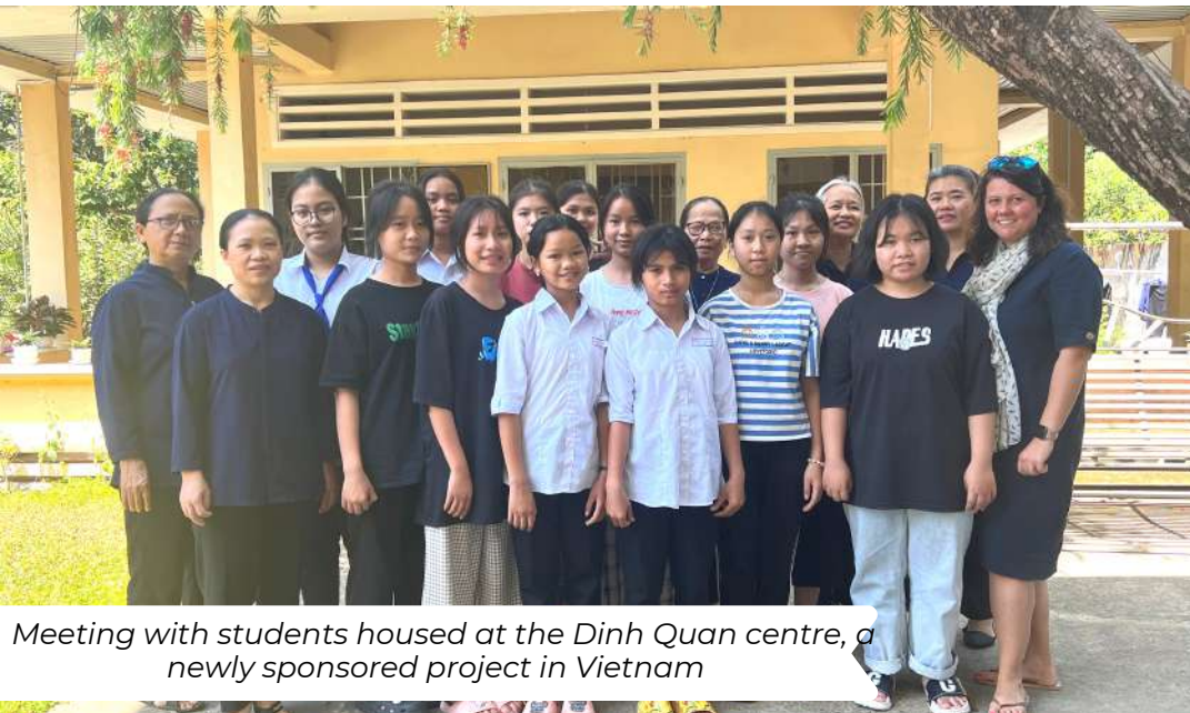
Meeting with students housed at the Dinh Quan centre, a newly sponsored project in Vietnam

In the 2022/2023 school year, I was able to carry out three sponsorship missions in three countries: Armenia, Vietnam and Lebanon. These missions enabled me to meet 427 children for their annual interviews and over 1,000 children attending the centres supported by the project sponsorship.