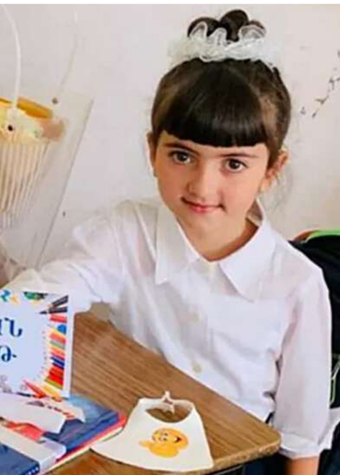
Newly sponsored Gumri - Armenia 2021

The desire to resume all activities is very strong and the prospect of resuming them in September is considered.