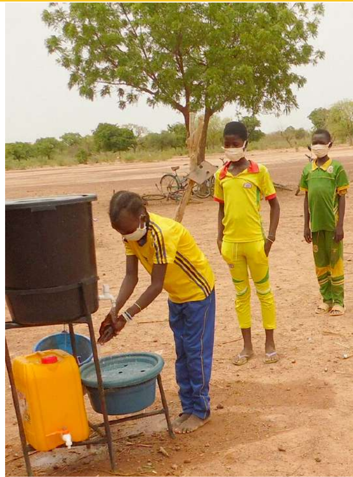
Barrier gestures at the Guié school Burkina 2021

*We offered 16 tablets to the sponsored children of the Saint Vincent de Paul school in Beirut.