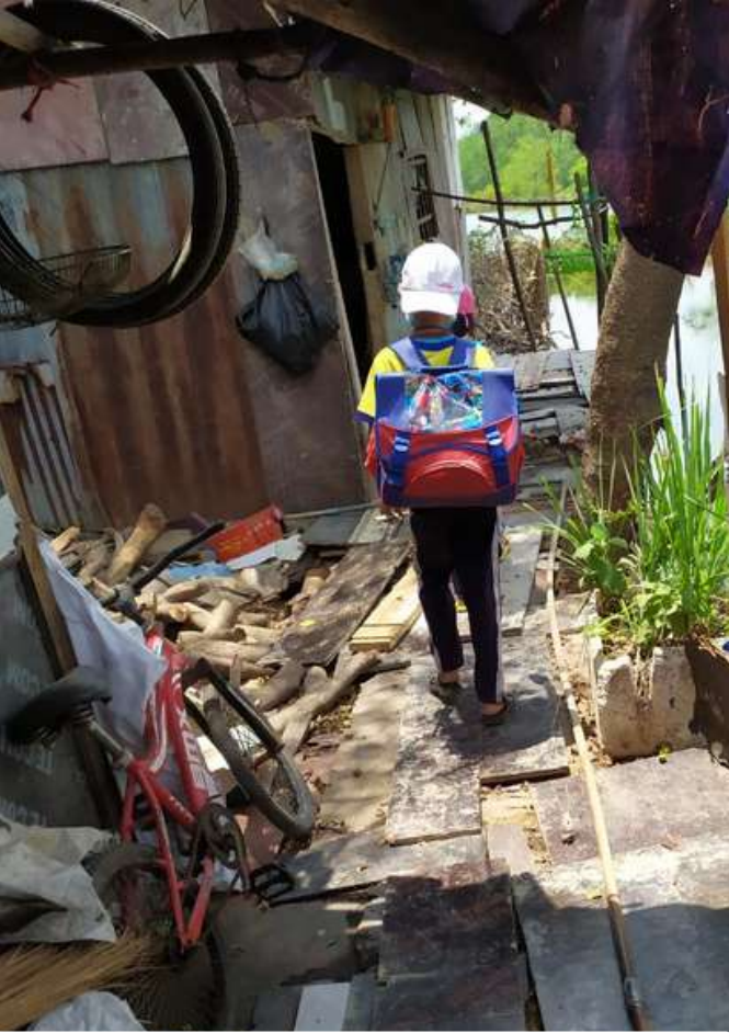
Sur les chemins de l'école Ho Chi Minh - Việt Nam 2021

The Covid crisis, and the financial and social crises that followed, have had a major impact on the education of your young godchildren. Online courses, distance learning and the use of computer technology have not been available to everyone. With the active support of our local coordinators, centre managers and the sisters of the different Congregations in the four countries of intervention, the children have redoubled their efforts and commitment to complete their schooling. At the beginning of 2021, despite the circumstances, some twenty new sponsors have joined this human adventure.