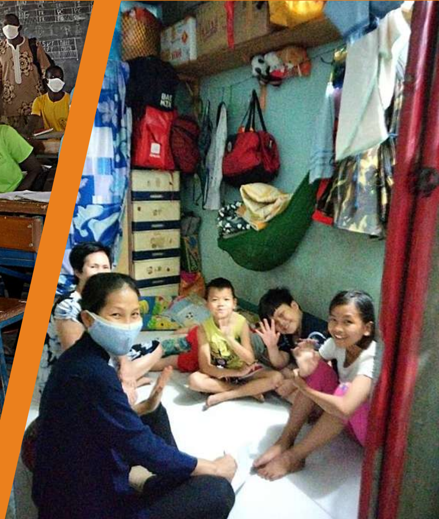
"Home Visit" in the slums of Cho Quan students in VietNam

Like the majority of students around the world, the sponsored children in Burkina Faso and Vietnam have added the mask to their school supplies. For many of them, they are finishing their exams to move on to the next grade.