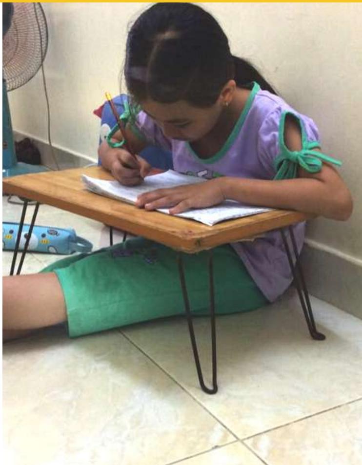
Home schooling Ho Chi Minh - Vietnam 2021