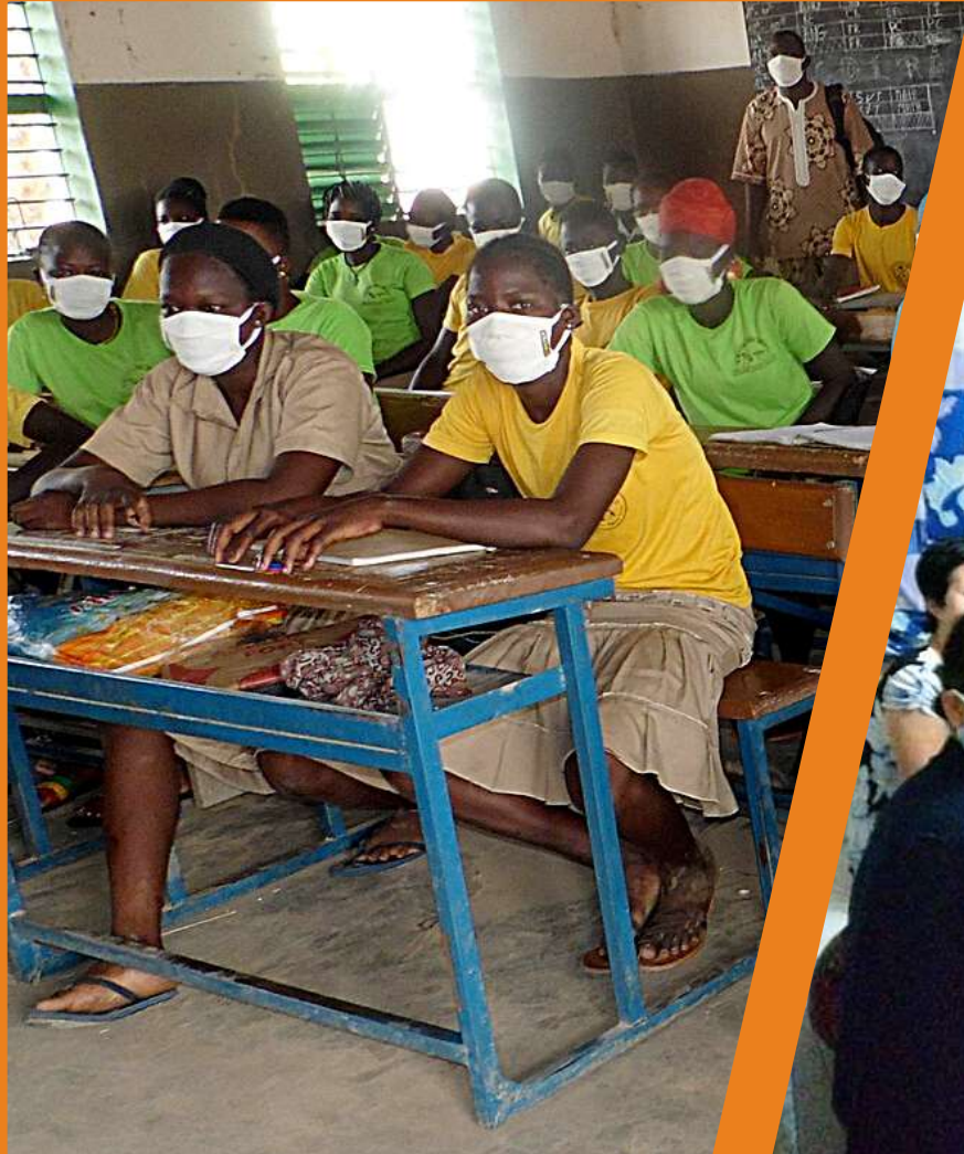
Students of Guié High School Burkina Faso